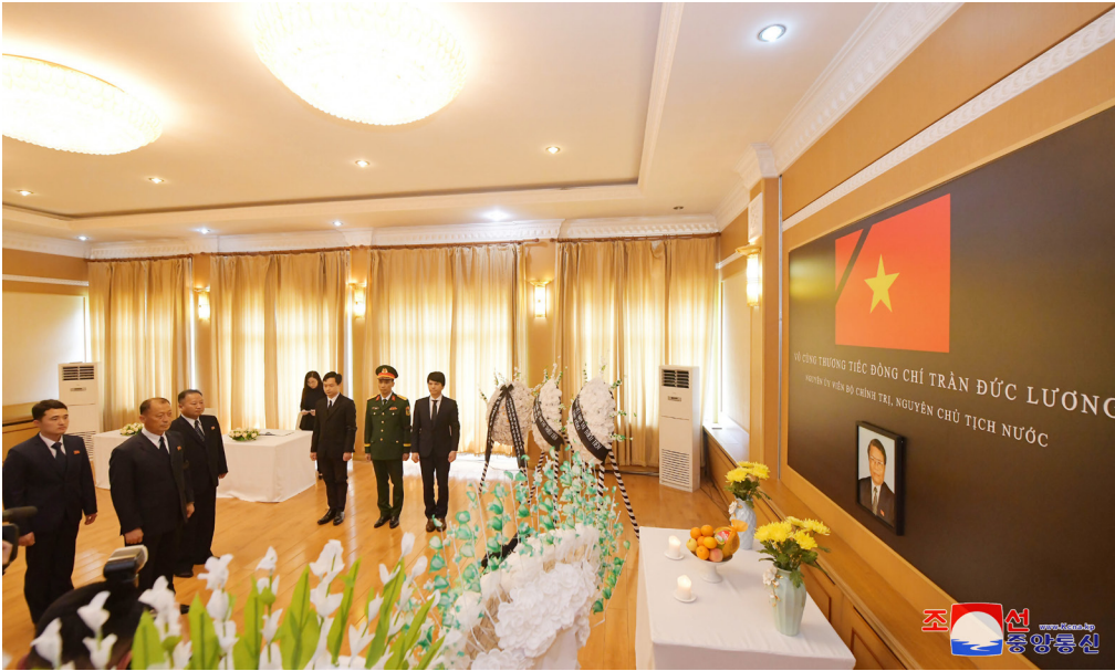
Officials of the Ministry of Foreign Affairs, the Ministry of External Economic Relations and the Bureau for Affairs with Diplomatic Corps of the DPRK visit the Vietnamese embassy in Pyongyang on May 25 to express condolences over the death of Tran Duc Luong, former president of the Socialist Republic of Vietnam.

The participants paid silent tribute to the memory of Tran Duc Luong who contributed to accomplishing the socialist cause of the Vietnamese people and developing the friendly relations between the DPRK and Vietnam and made entries in a condolence book.