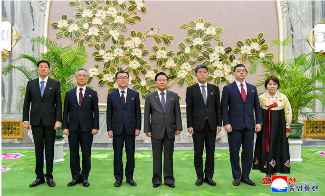
Choe Ryong Hae, chairman of the Standing Committee of the Supreme People's Assembly of the DPRK, meets the group of Koreans in Japan for expressing thanks to the homeland on the 70th anniversary of the General Association of Korean Residents in Japan.