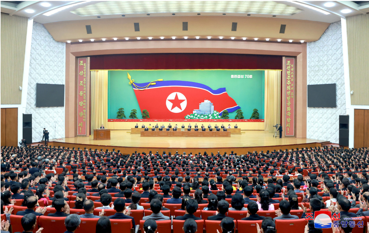
A national meeting is held at the People's Palace of Culture in Pyongyang on May 25 to mark the 70th founding anniversary of the General Association of Korean Residents in Japan (Chongryon).