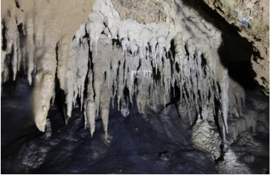
Stalactites at the entrance to section No. 5.