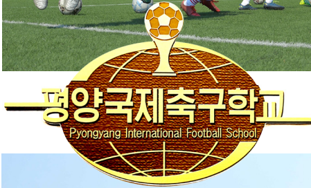
Schoolchildren practice football skills at Pyongyang International Football School.