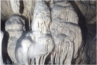
Stalactites in section No. 6.