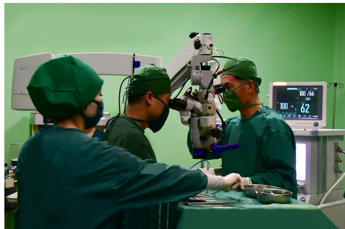
A surgical operation using cutting-edge technologies is performed by the research team of the neurosurgery department of Pyongyang University of Medical Sciences.