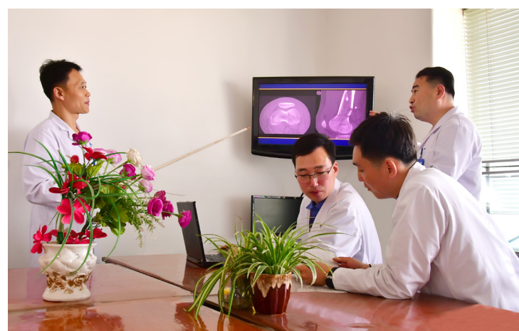
Doctors have a preoperative consultation at the general trauma surgery department of the Kim Man Yu Hospital.

Whenever people leaving the hospital after recovering their health express gratitude, the doctors say it is the natural duty of medical workers to take responsibility for the life of human beings.