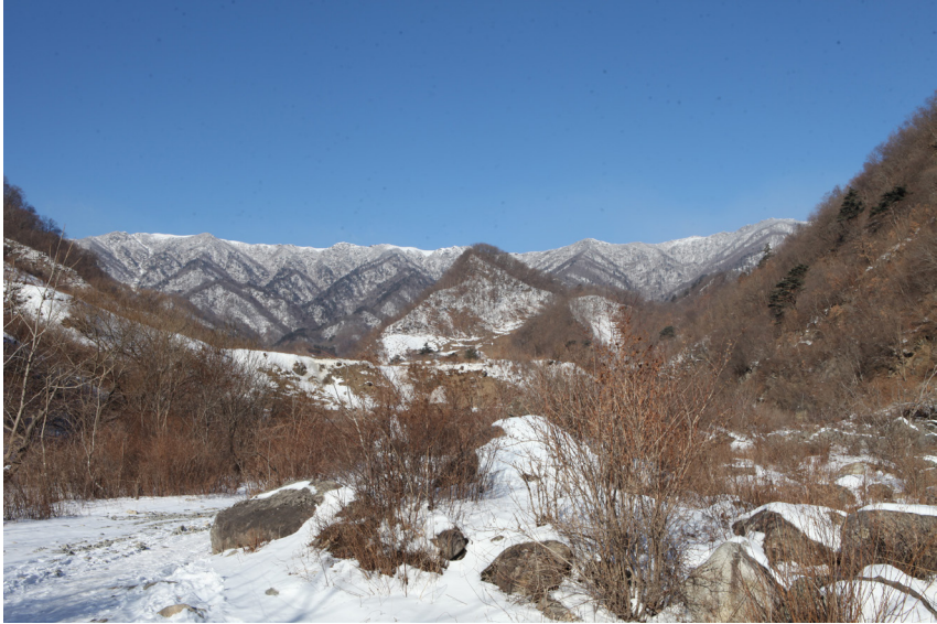
The Iryong Cave is located on a hillside in the eastern part of the Puktaebong Mountains.

South Hamgyong Province and Kowon County are now taking practical measures to preserve the cave.