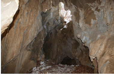
The entrance to the cave seen from the inside.