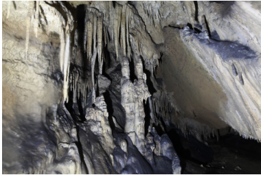
The "couple" stalagmite in section No. 5.